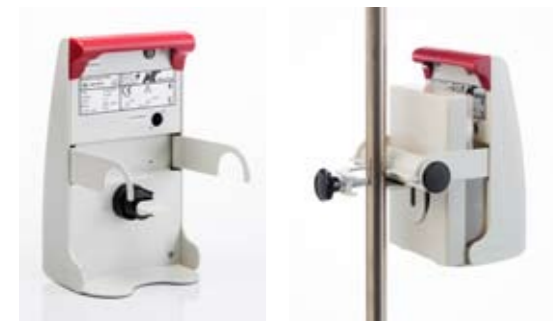
Integrated bed holder