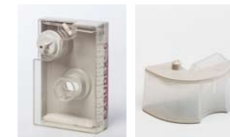
Canister Exsudex® XL