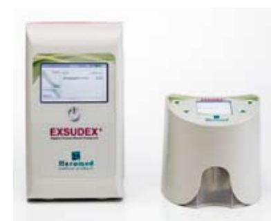
Exsudex® XL Exsudex® XS